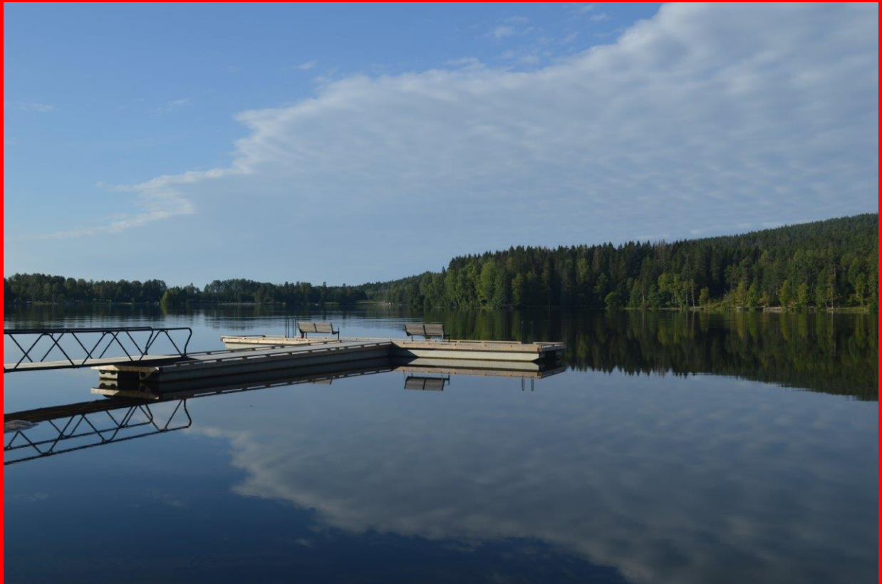
Sognsvann Lake, Oslo, Norway